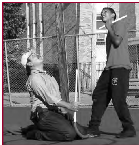
How high will his rocket fly? STEM courses can launch careers.

Attention Alumni! CP’s 30th Anniversary is coming up and we want YOU and all your classmates at the party. We’re missing contact info for more than 20% of alumni. You can help. Go to communityprep.org/foralumni.html and let us know where to find your friends.